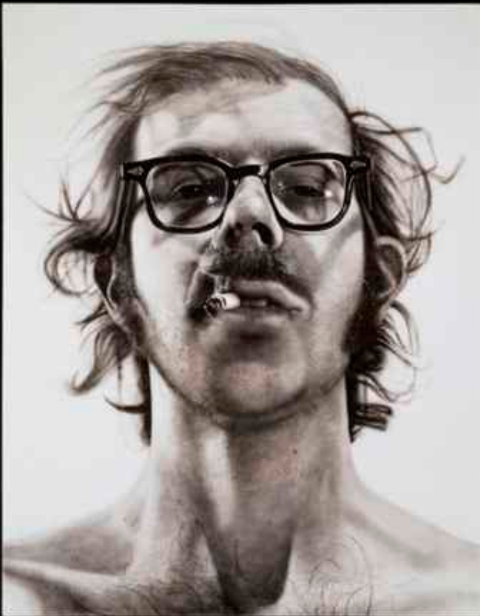
Chuck Close "Self Portrait" Graphite on Paper 1867-1968