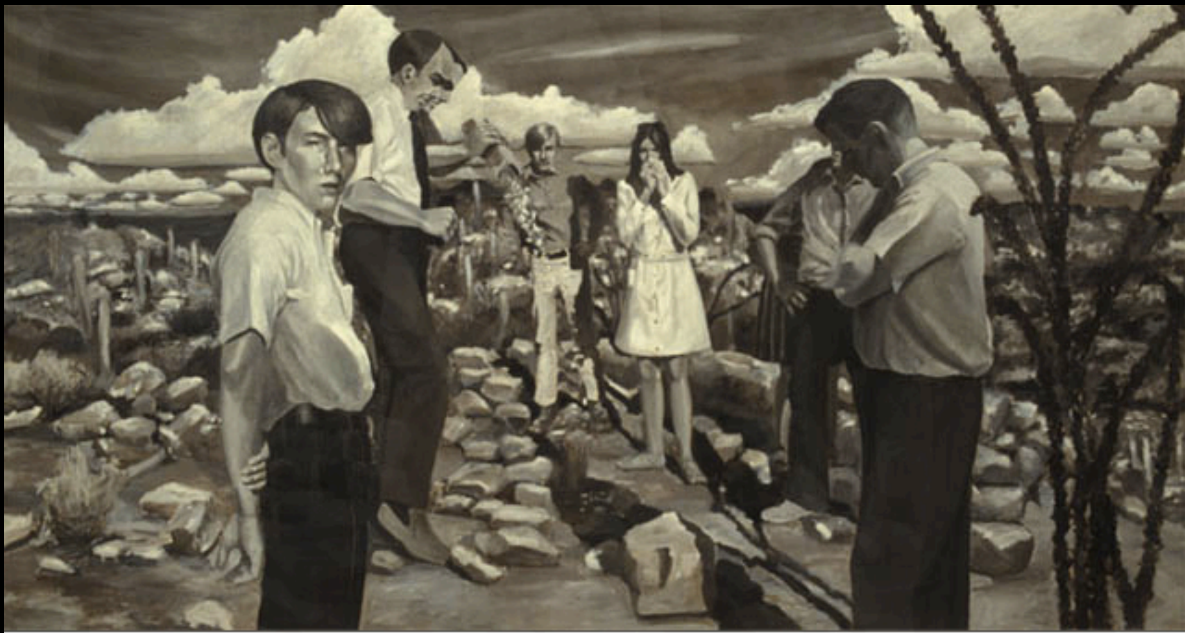
Eric Fischl "The Funeral" Oil on Canvas 1980