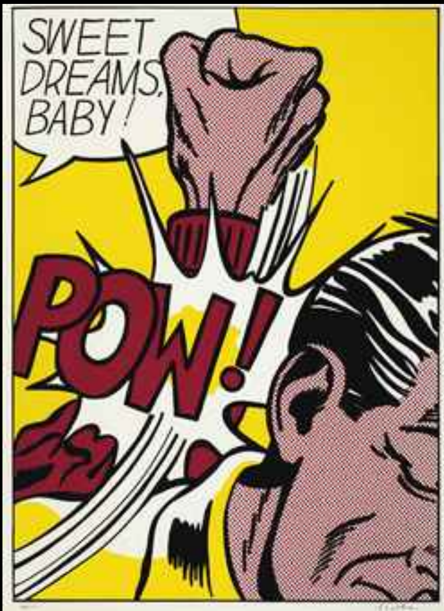
Roy Lichtenstein "Sweet Dreams Baby" Screenprint 1965