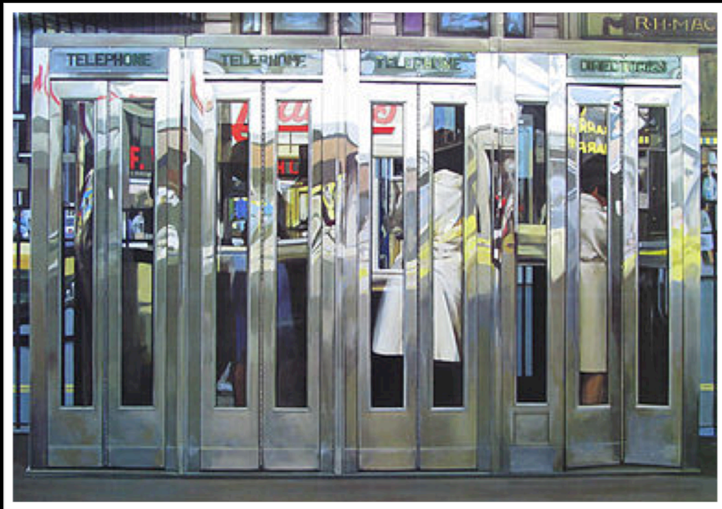
Richard Estes “Telephone Booths” Oil on Canvas 1968