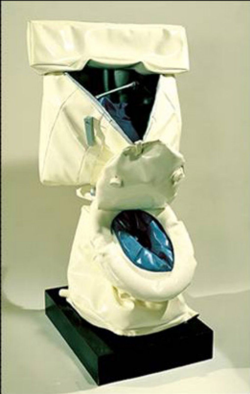
Claes Oldenburg "Soft Toilet" Wood, Vinyl, Plexiglass 1966