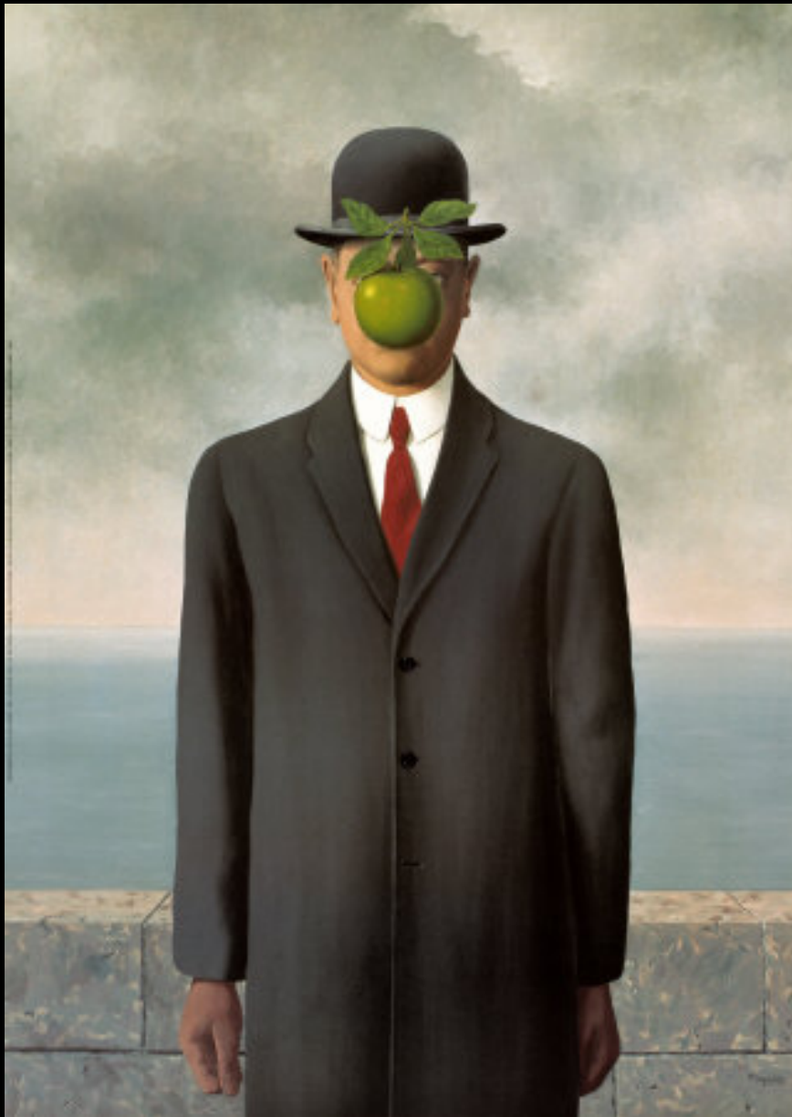
Rene Magritte "The Son of Man" 1964