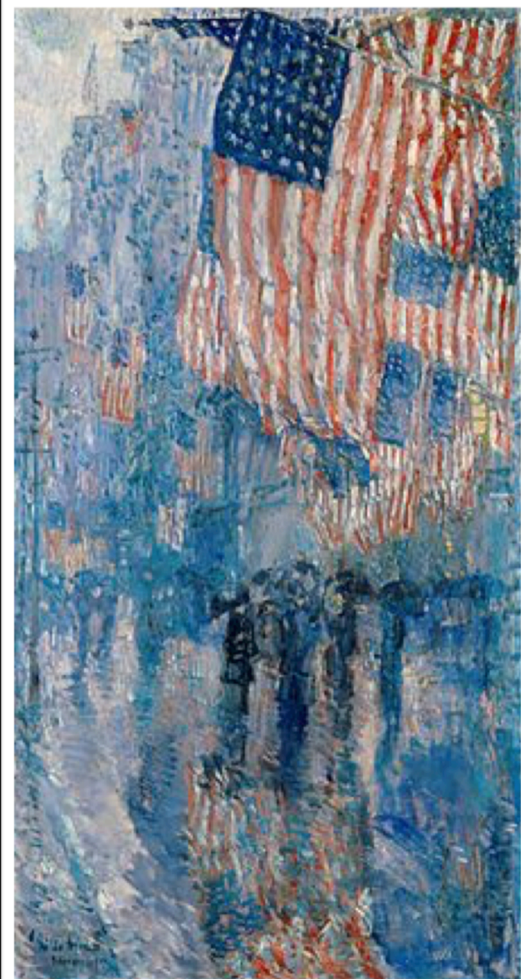
Childe Hassam "The Avenue in the Rain" Oil on Canvas 1917