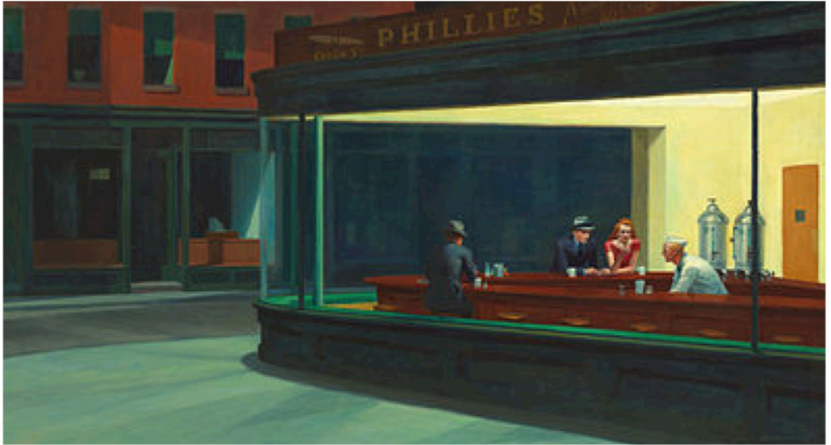
Edward Hopper "Night hawks" Oil on Canvas 1942